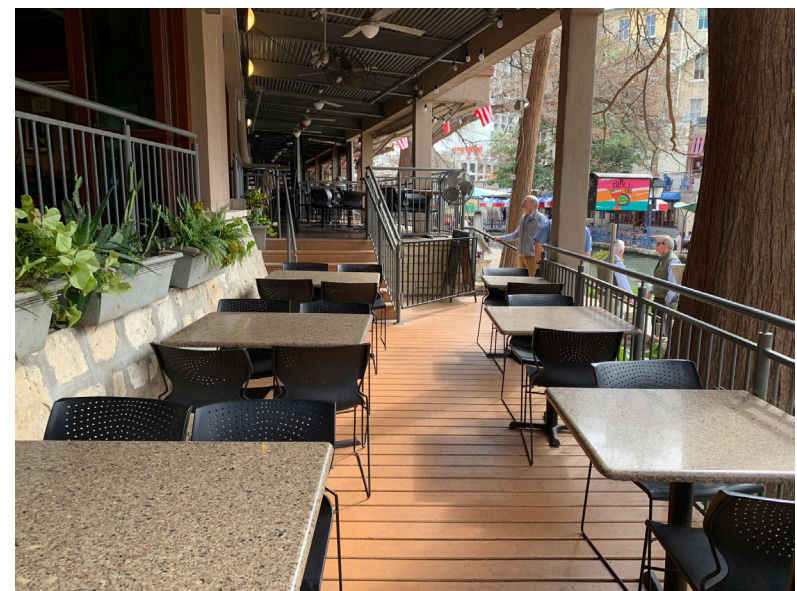
PATIO 1 AREA - PATIO LEVEL