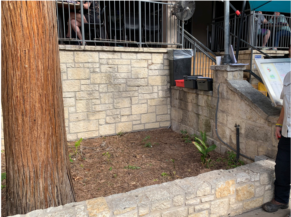
PATIO 1 AREA - GROUND LEVEL BEATY PALMER ARCHITECTS